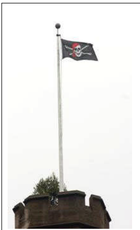
The Hall Tower In Preparation For A Pirate Themed Dance.

If Haas gets its wishes, the interior would be gutted, with the hall's living room and stairs to be preserved